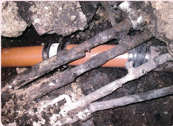
Under pressure A new section of pipe squeezed into place.