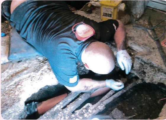
Tight spot Little space to work – a common challenge.